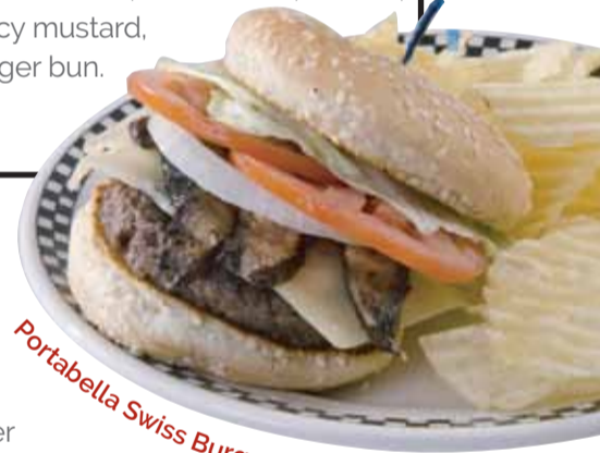
Portabella Swiss Burger