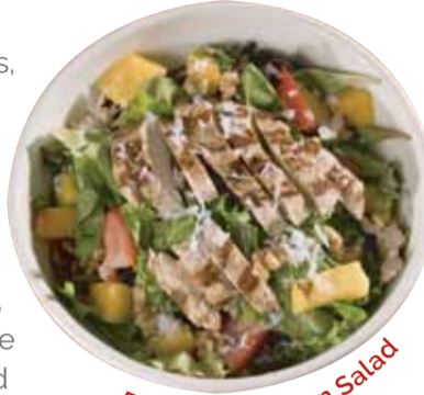
Brazilian Chicken Salad

Mixed spring greens, peaches, pineapple, blueberries, walnuts, strawberries, coconut flakes, grilled chicken breast and our tropical dressing. 9.70